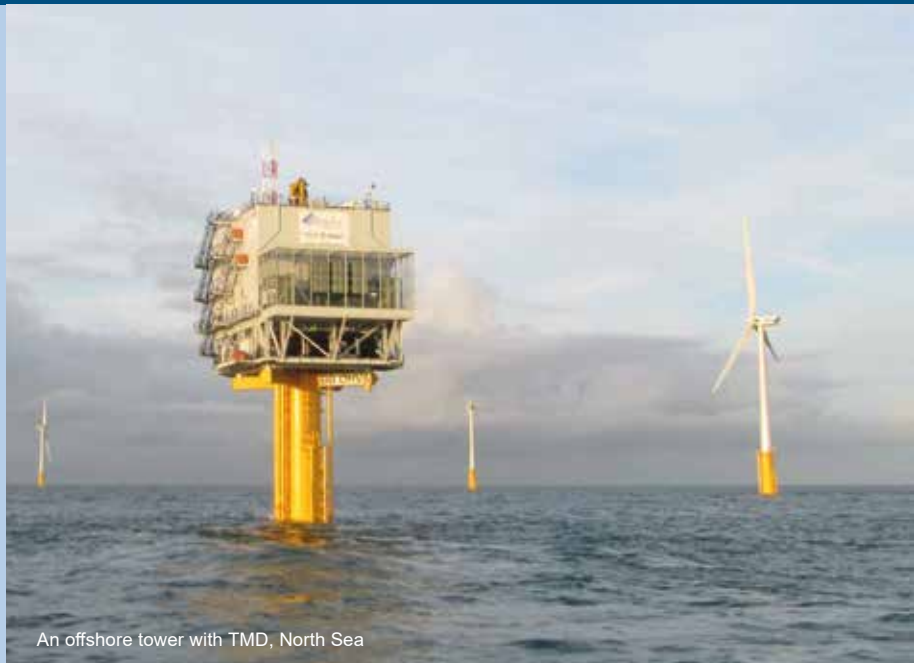
An offshore tower with TMD, North Sea