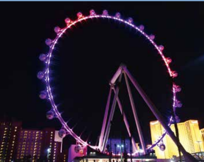
High roller with TMDs for protection from wind-forced vibrations, Las Vegas, USA