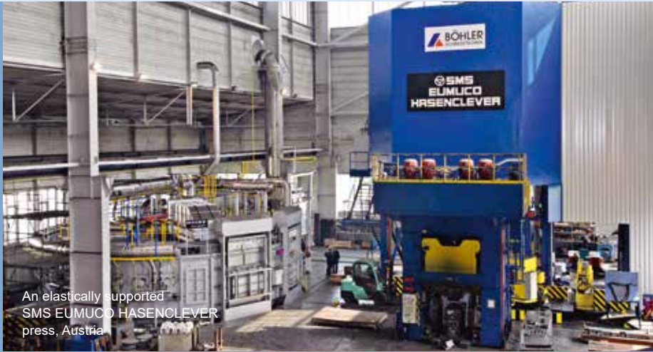
An elastically supported SMS EUMUCO HASENCLEVER press, Austria

Throughout the world, GERB has succeeded in isolating the largest and most complicated presses in a very effective manner.