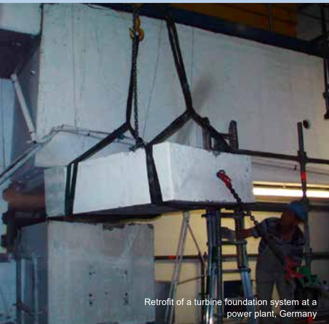
Retrofit of a turbine foundation system at a power plant, Germany