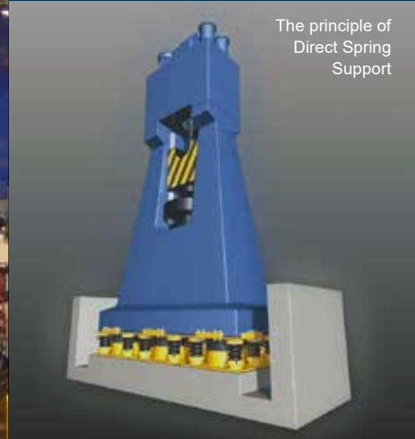
The principle of Direct Spring Support