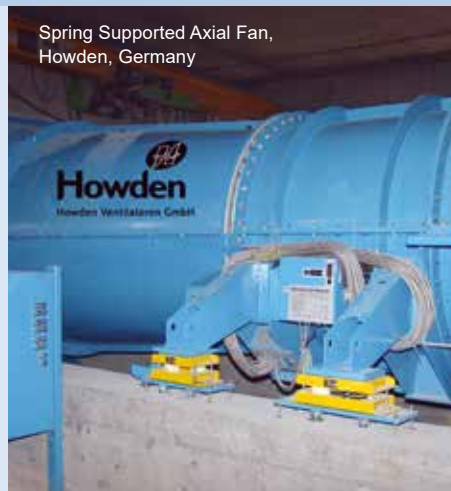
Spring Supported Axial Fan, Howden, Germany

The efficiency of vibration isolation of more than 95% will not cause any disturbance to the surrounding area. Furthermore, the low total weight of the spring supported fan protects from settlement of the sub-structure .