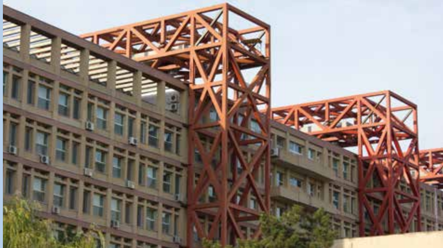
The retrofit of a hospital building by a GERB Tuned Mass Control System, Slobozia, Romania

For further information please do not hesitate to contact us.