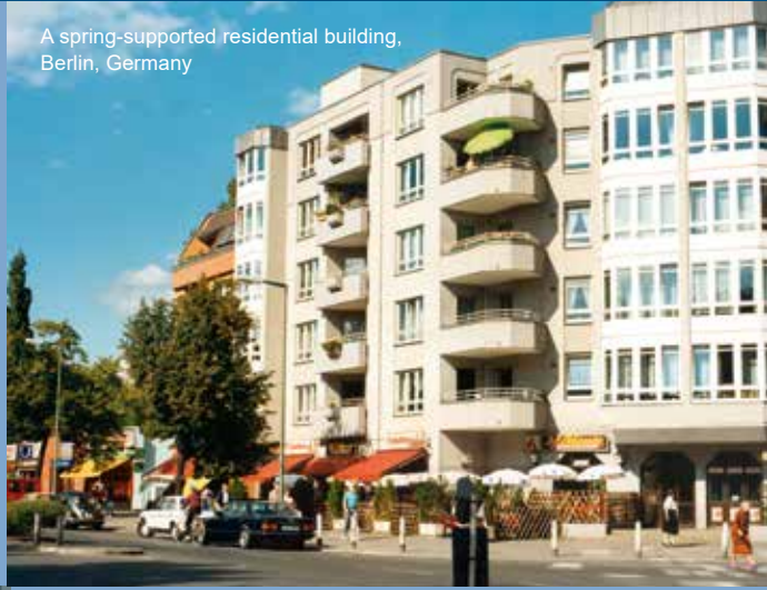
A spring-supported residential building, Berlin, Germany

GERB spring elements are installed below buildings, in pockets arranged within basement walls, or on top of walls and columns above ground level.