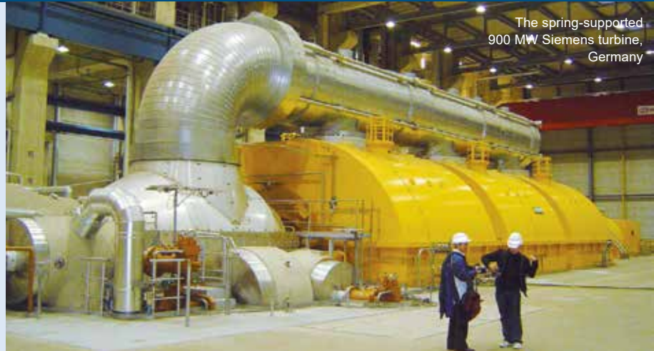
The spring-supported 900 MW Siemens turbine, Germany

Spring supported condensers enable thermal expansion without any restrictions.