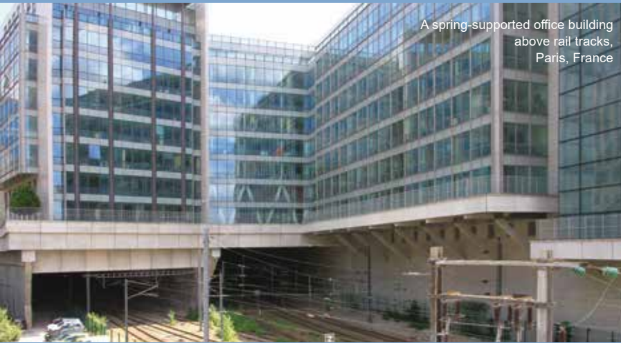
A spring-supported office building above rail tracks, Paris, France

GERB spring elements are designed to take loads ranging from 10 to 300 metric tons and even higher.