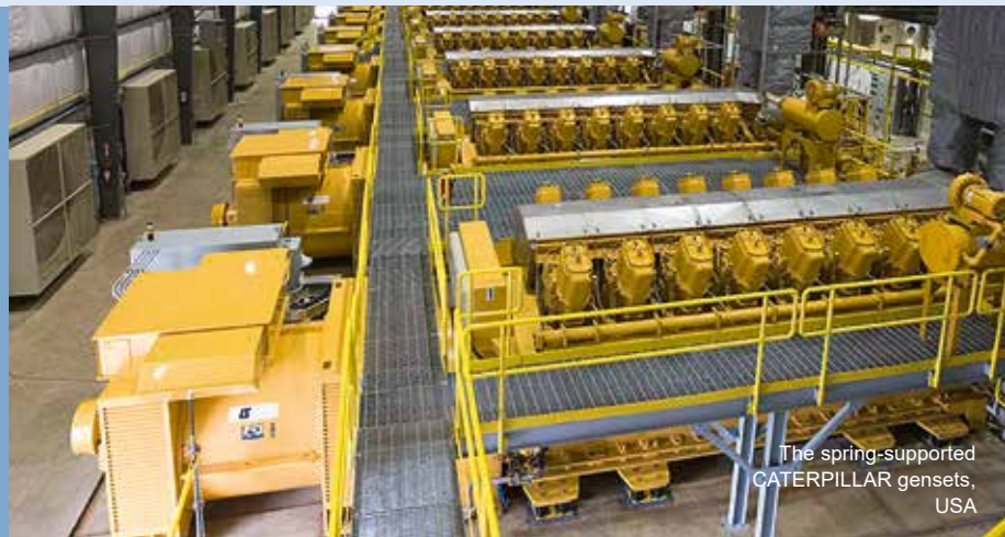
The spring-supported CATERPILLAR gensets, USA

GERB elastic support systems provide an efficiency of isolation that reaches up to 98% . Consequently, this helps to avoid the settlement of the substructure as well as damage to the machines in cases of earthquakes . Our spring support systems are used for all types of gensets, including emergency gensets.