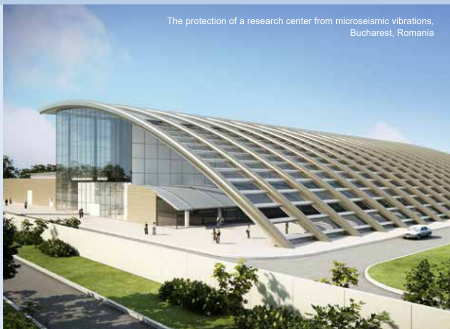
The protection of a research center from microseismic vibrations, Bucharest, Romania

GERB provides design, civil engineering, products for isolation, installation and inspection services that can be tailor-made for your specific requirements.