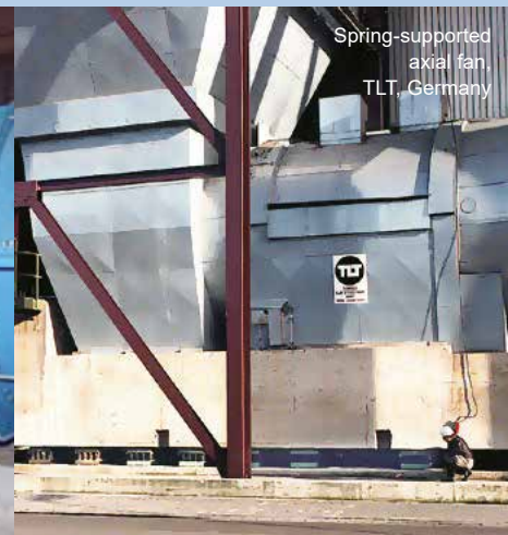
Spring-supported axial fan, TLT, Germany