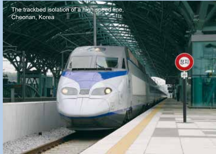
The trackbed isolation of a high speed line, Cheonan, Korea

Nowadays, GERB Floating Slab Systems represent highly effective and long-term reliable vibration mitigation systems that are recognized by experts all over the world.