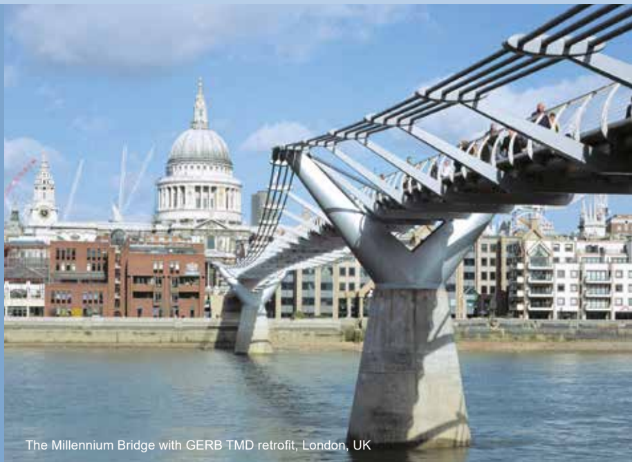
The Millennium Bridge with GERB TMD retrofit, London, UK

GERB's TMDs are specially designed to reduce these vibrations of heavy structures and for the required application.