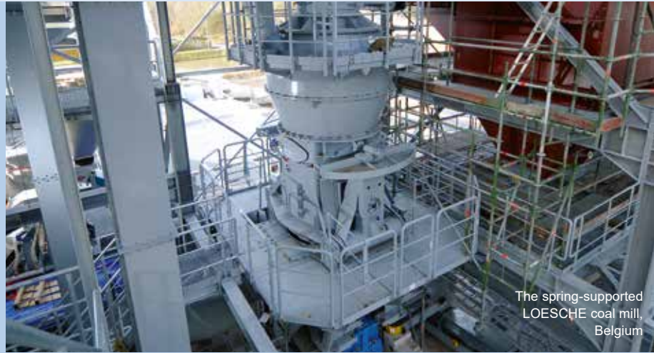
The spring-supported LOESCHE coal mill, Belgium

Mills and crushers of all types, especially those in power plants and the cement industry, generate heavy random type dynamic forces that affect nearby boilers, control instruments and other equipment. Spring support not only reduces maintenance costs as a result of less wear and tear, but also allows for smaller foundations that eliminate layout constraint at the site.