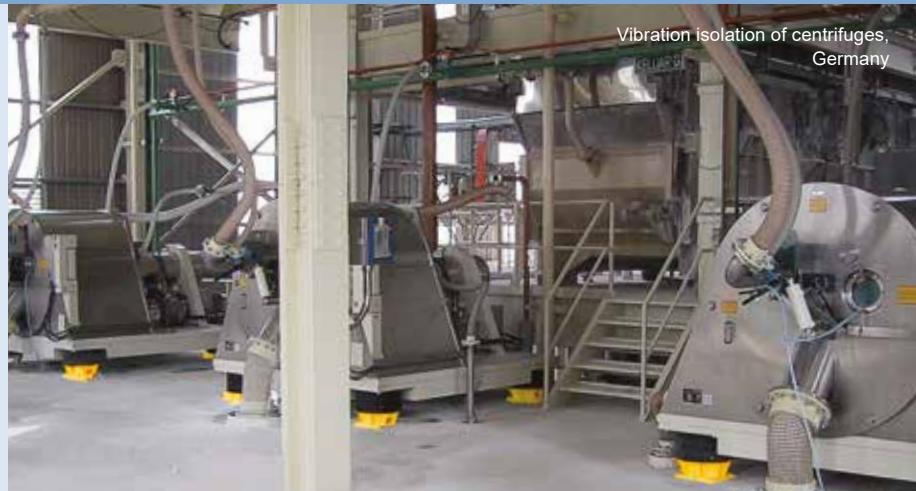
Vibration isolation of centrifuges, Germany

Our 4 point isolation system has replaced the standard type 3 point supporting systems on a global level.