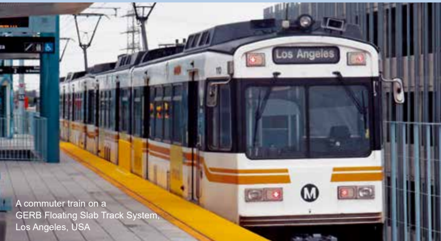
A commuter train on a GERB Floating Slab Track System, Los Angeles, USA

Systems with vertical natural frequencies as low as 3 to 8 Hz provide excellent attenuation levels. They are successfully installed in tunnels, above ground and on elevated rail tracks worldwide. In particular, they are available for