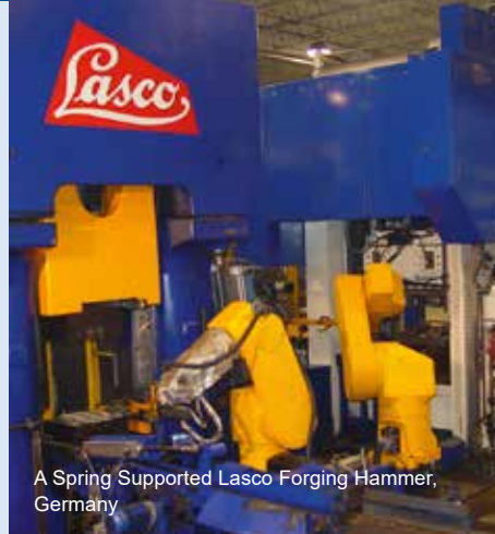
A Spring Supported Lasco Forging Hammer, Germany