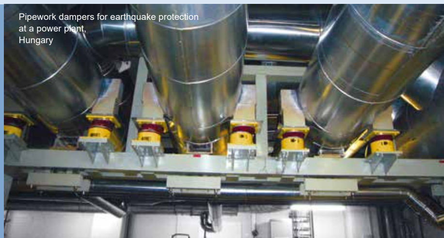
Pipework dampers for earthquake protection at a power plant, Hungary