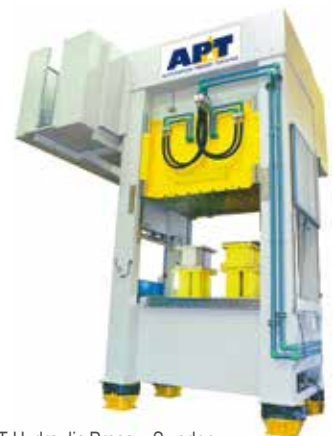
AP & T Hydraulic Press – Sweden