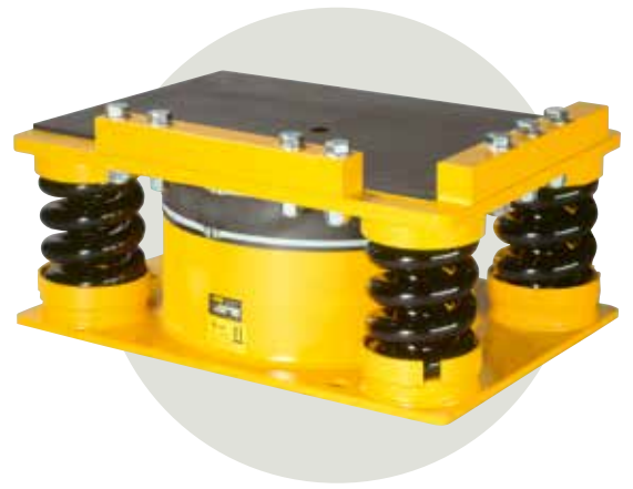
Typical Spring Viscodamper® Combination for Elastic Support of Presses

During the operation of presses, strong vibrations are caused by speed changes of moving parts, the impact of the ram and especially during cutting processes, which can lead to unacceptable disturbance and inconvenience in the neighbourhood. Moreover, high-frequency vibration components lead to structure-borne noise in adjacent rooms.