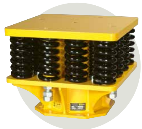
Typical Spring Viscodamper® Combination for Elastic Support of Presses

GERB has developed support systems, in close cooperation with renowned manufacturers of servo presses that meet these requirements.