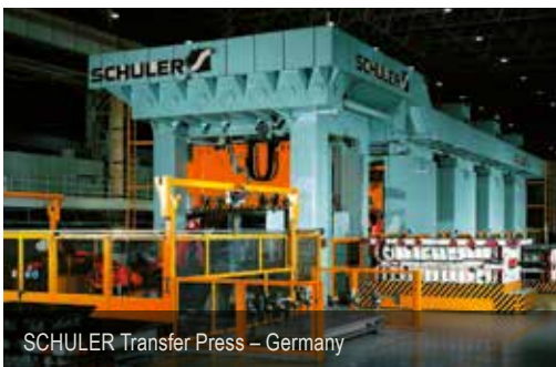
SCHULER Transfer Press – Germany

Please consult our project engineers for this purpose.