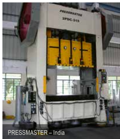
PRESSMASTER – India